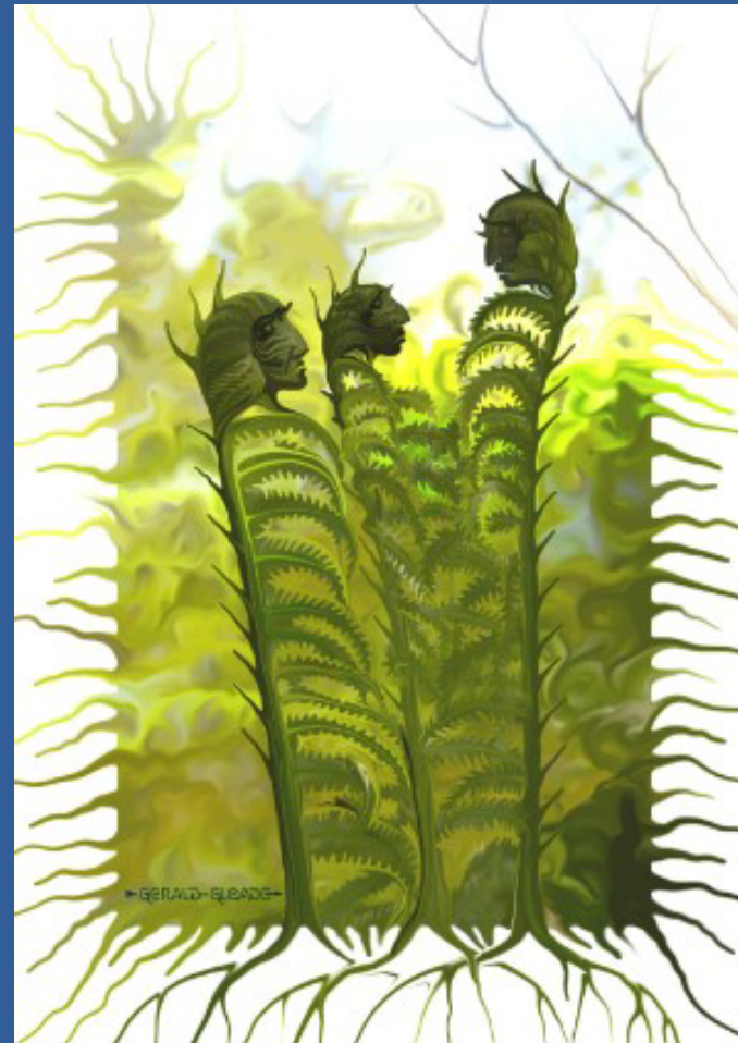
Artwork "Fiddlehead People" by Gerald Gloade, used with permission.